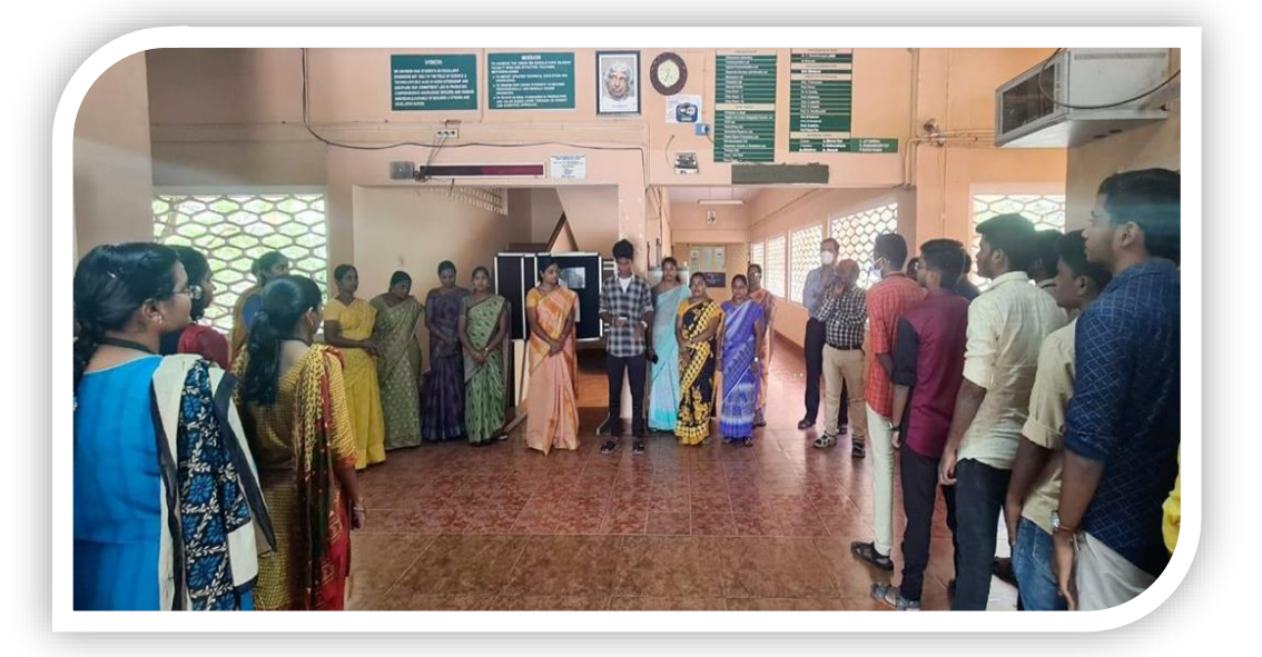
Department of Electronics and Communication Engineering