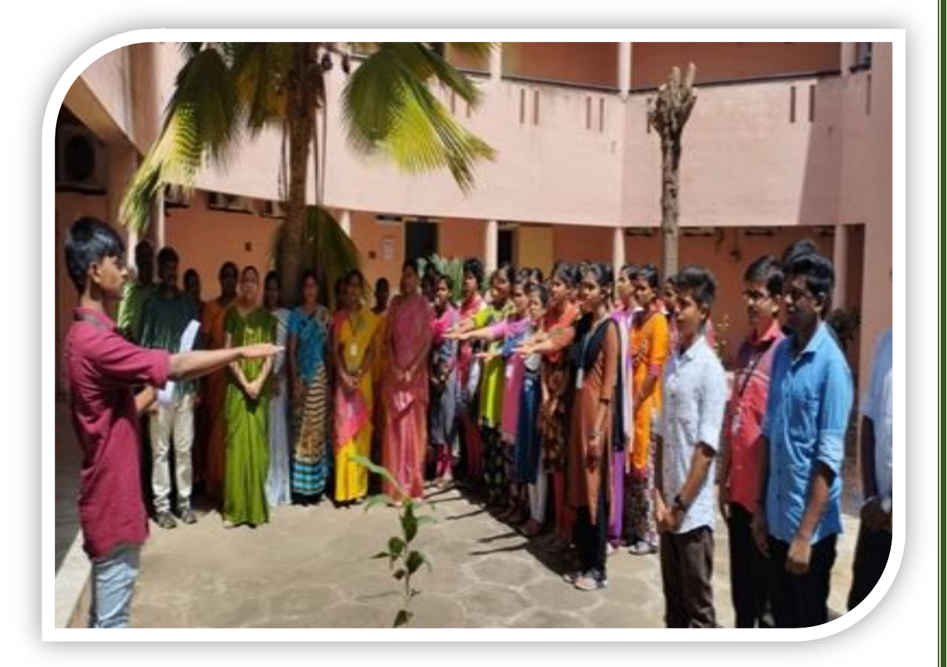
Department of Computer Science and Engineering