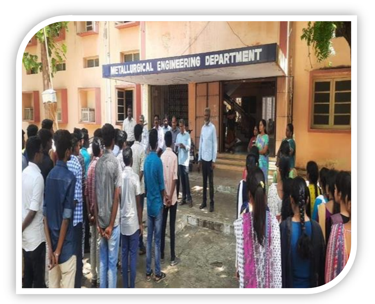
Department of Metallurgical Engineering