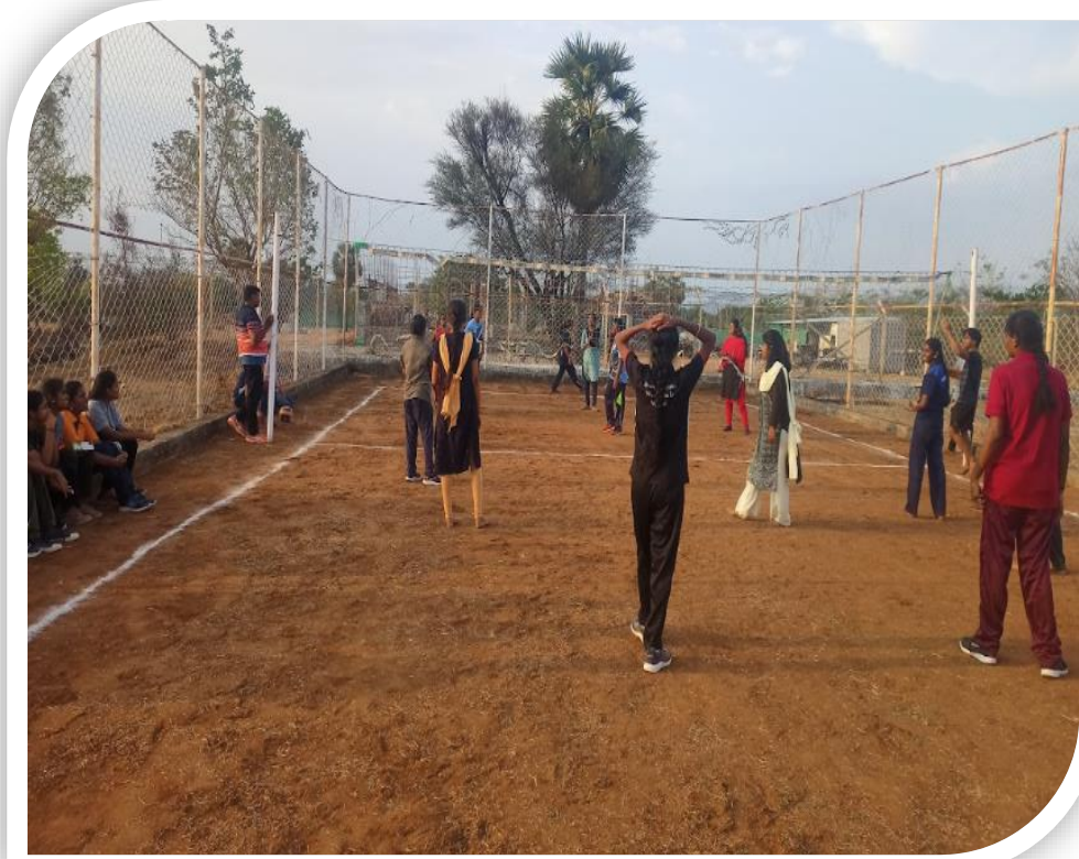
Women's Volleyball Competition