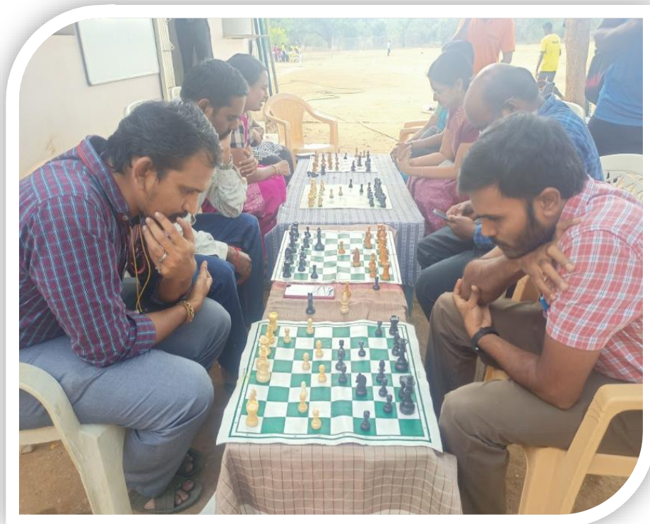
Men's Chess Competition