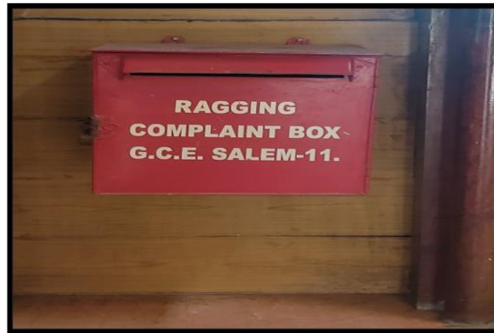
Figure 5 Complaint Box