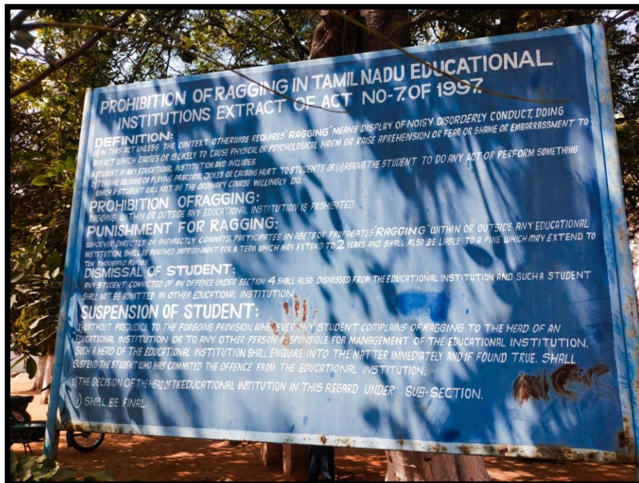
Figure 4 Anti Ragging Policy Displayed @ Boys Hostel