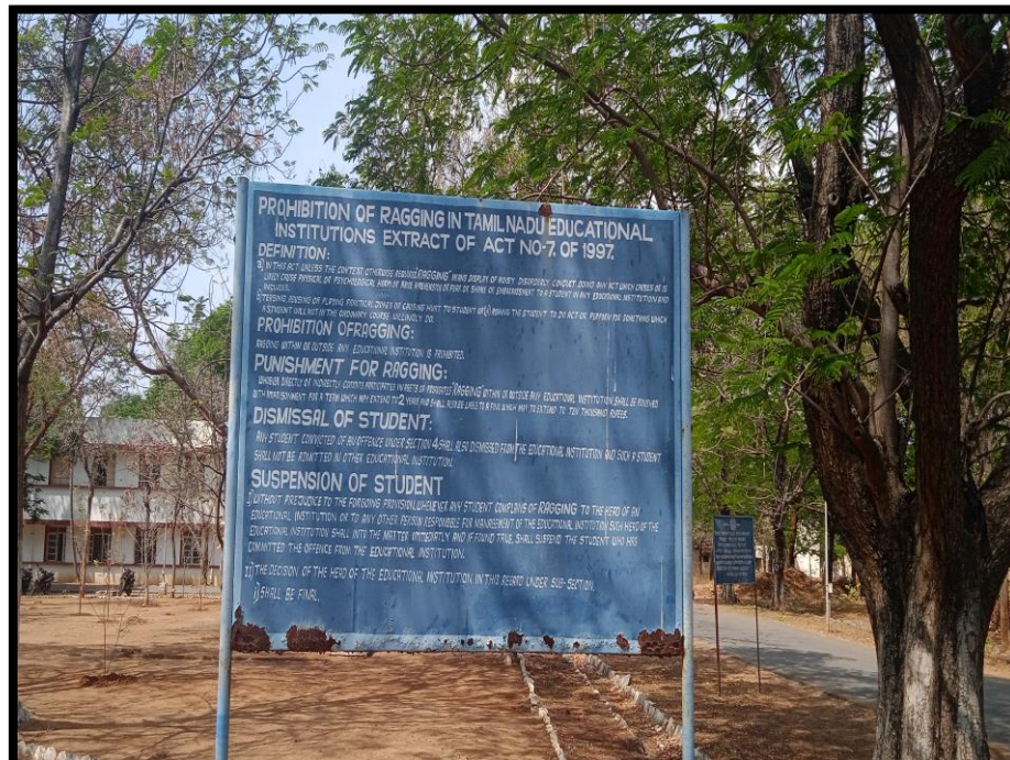
Figure 2 Anti Ragging Policy Displayed @ Main gate