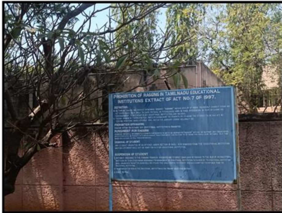
Figure 3 Anti Ragging Policy Displayed @ Girls Hostel