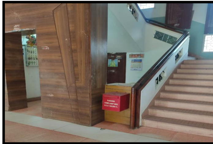
Figure 6 Complaint Box