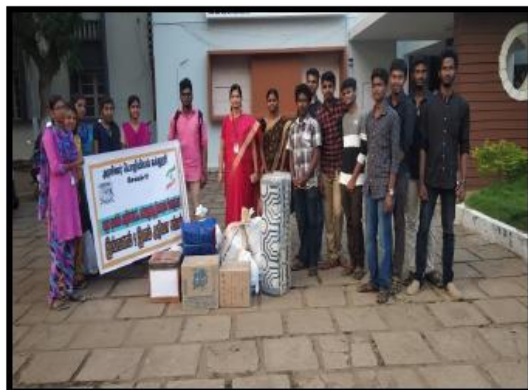
Figure 1.1: Collected funds and things from staffs and our students to affected people during Gaja cyclone

One of our college students is from the remote area of Mannarkudi in Thiruvavur district, those places are one of the most affected places during Gaja cyclone and didn't receive any kind of helps at those time. We decided to distribute the collected things in that place. Our Leo club students directly carry all those things to Mannarkudi and distribute those at that place.