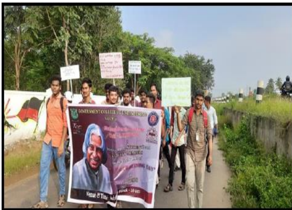
Figure 3.1: Student Volunteers with Poster