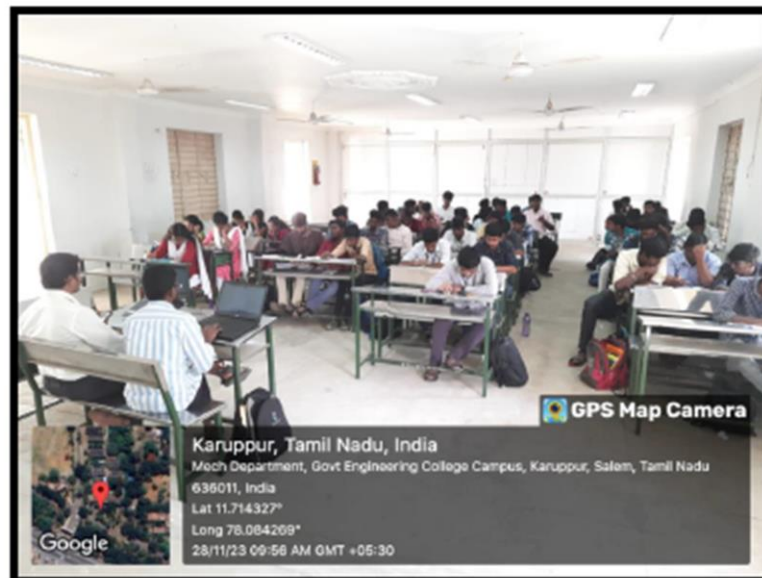
Lecture hall 6