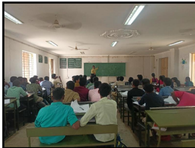
Lecture hall 7