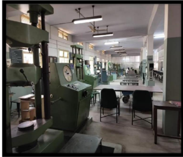
Strength of Material Laboratory