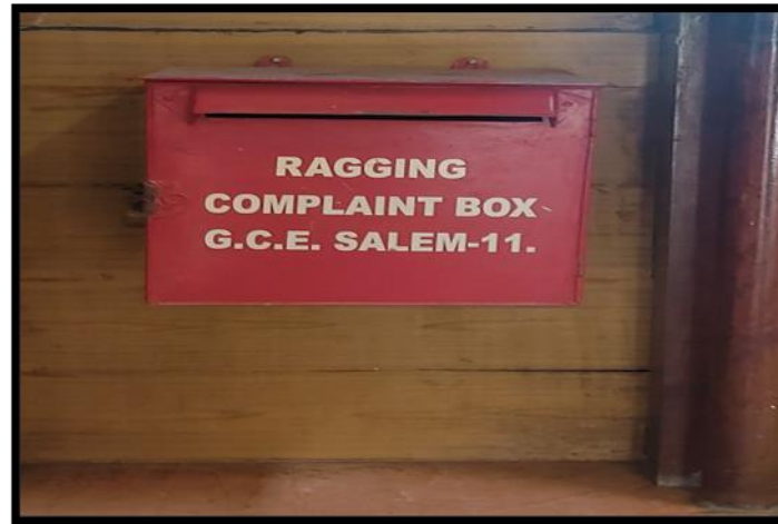
Figure 5 Complaint Box