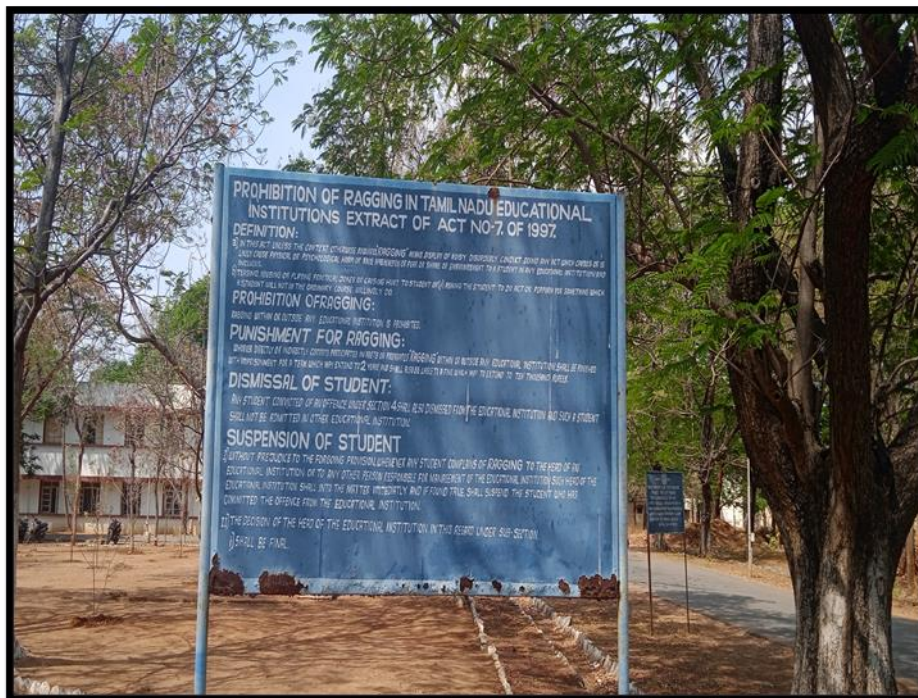
Figure 2 Anti Ragging Policy Displayed @ Main gate