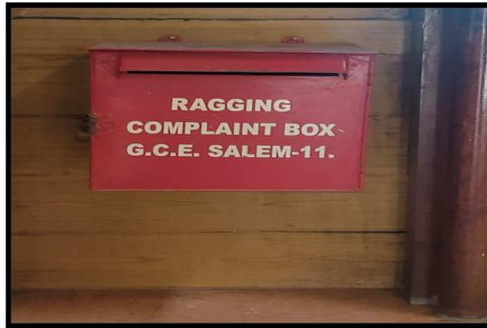
Figure 5 Complaint Box