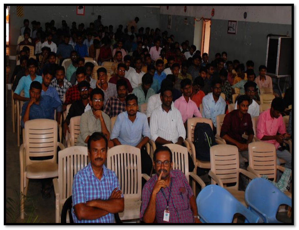
Students and Faculty Members