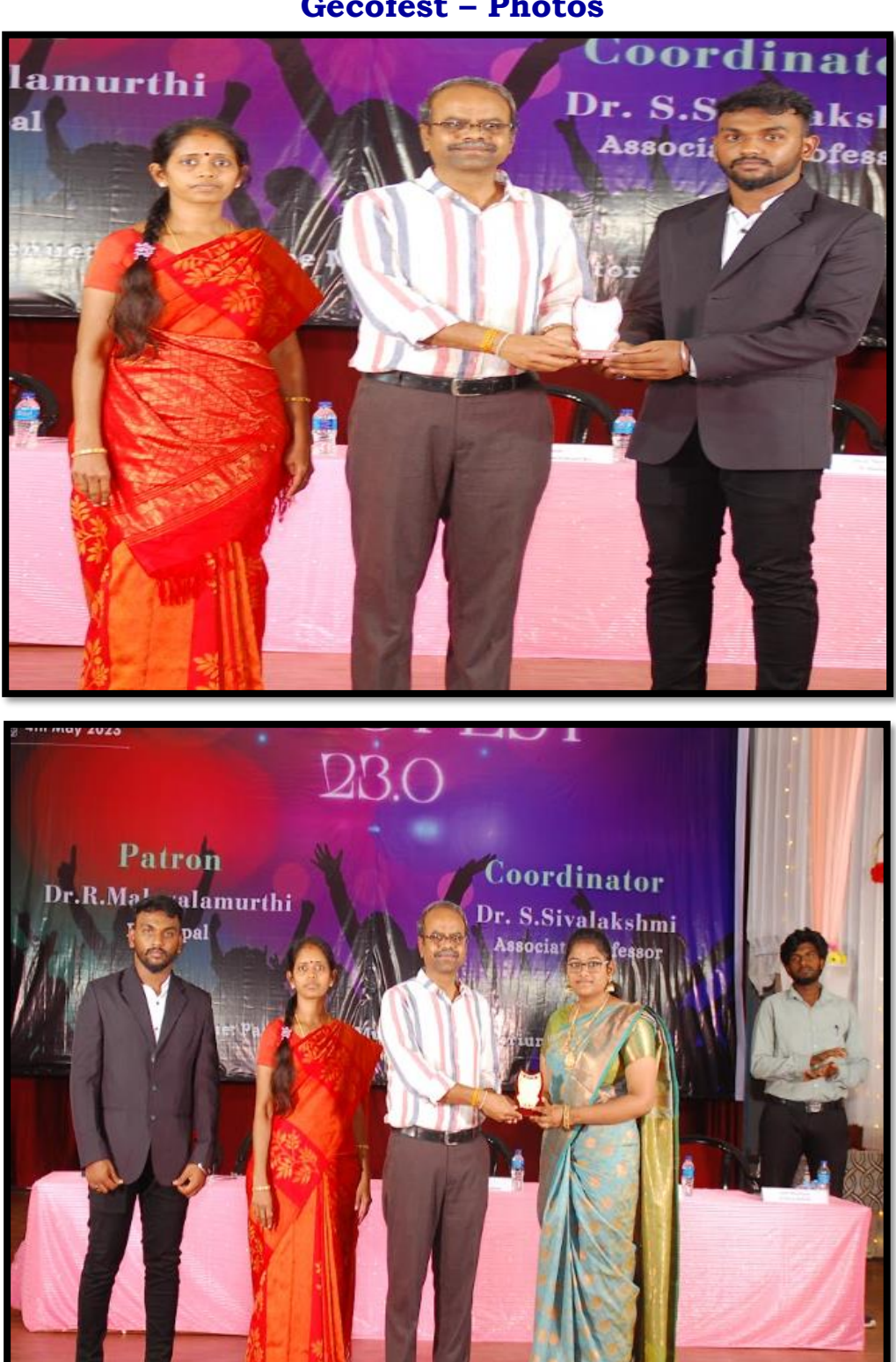
Gecofest – Photos