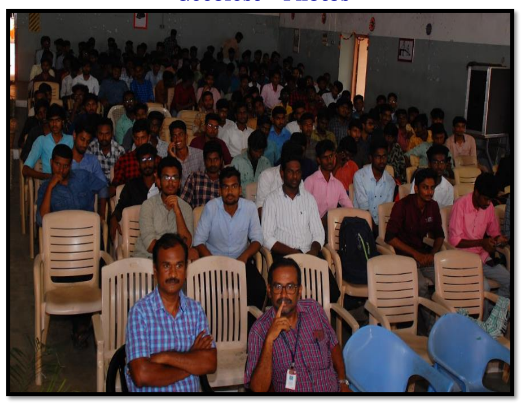
Students and Faculty Members