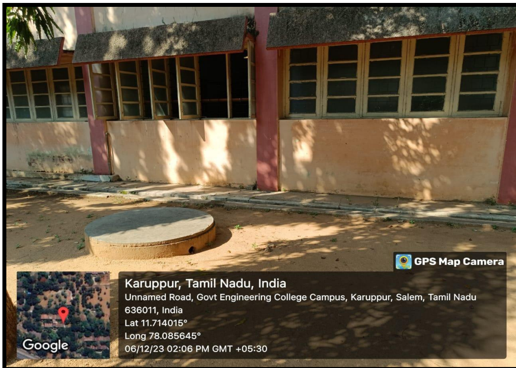
Figure 5: Rainwater harvesting Pit in Department of Metallurgical Engineering