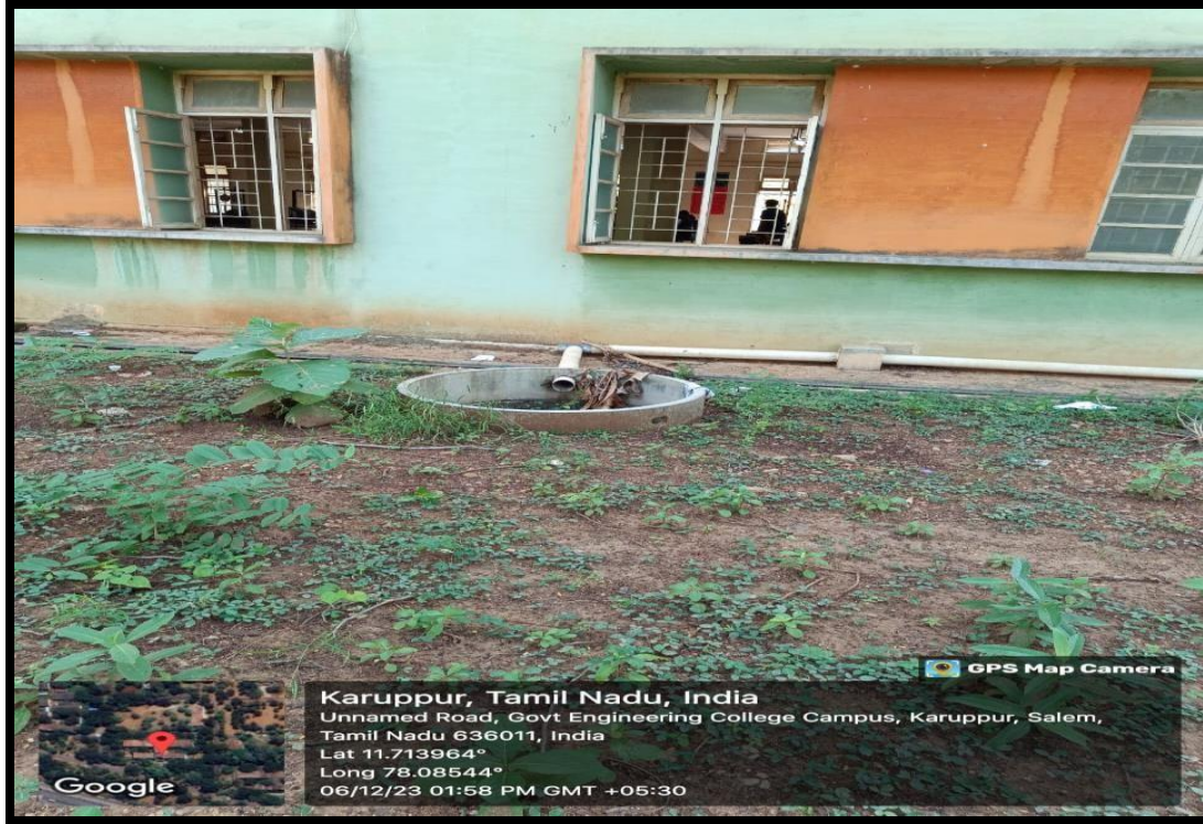
Figure 4: Rainwater harvesting Pit in Department of EEE