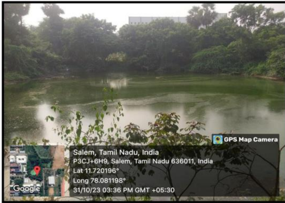
Waste water collection area