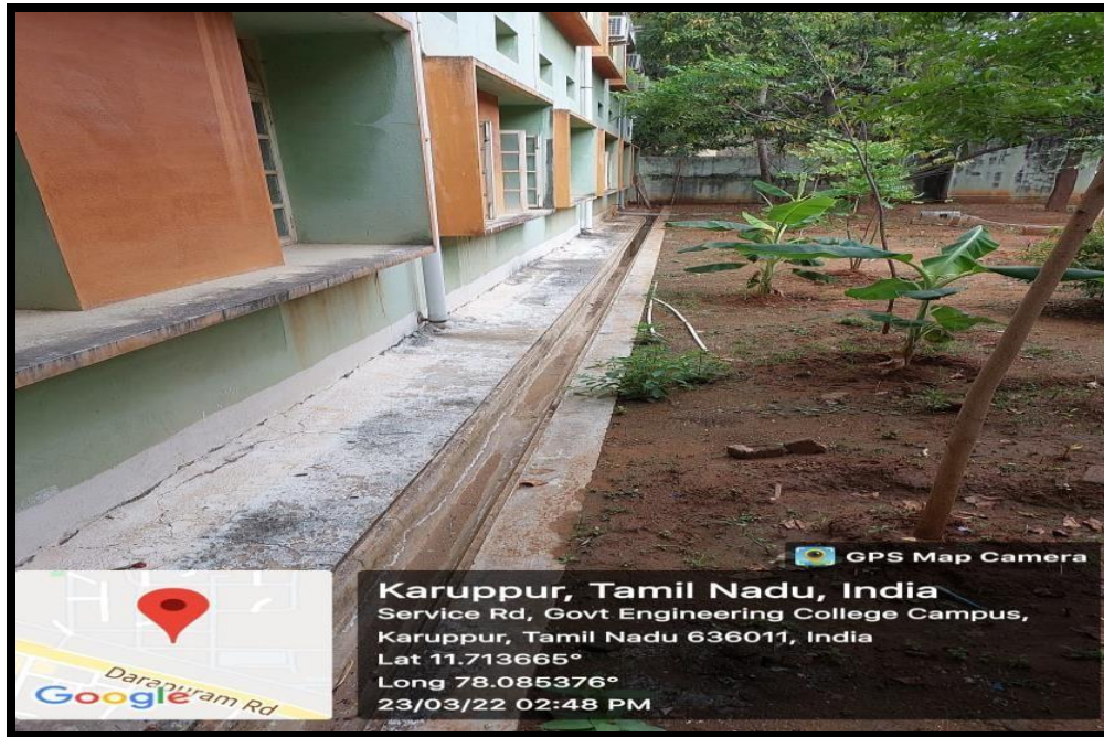
Figure 11: Water Distribution System