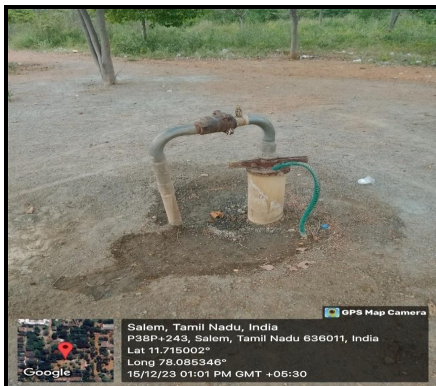
Figure 6: Bore well.