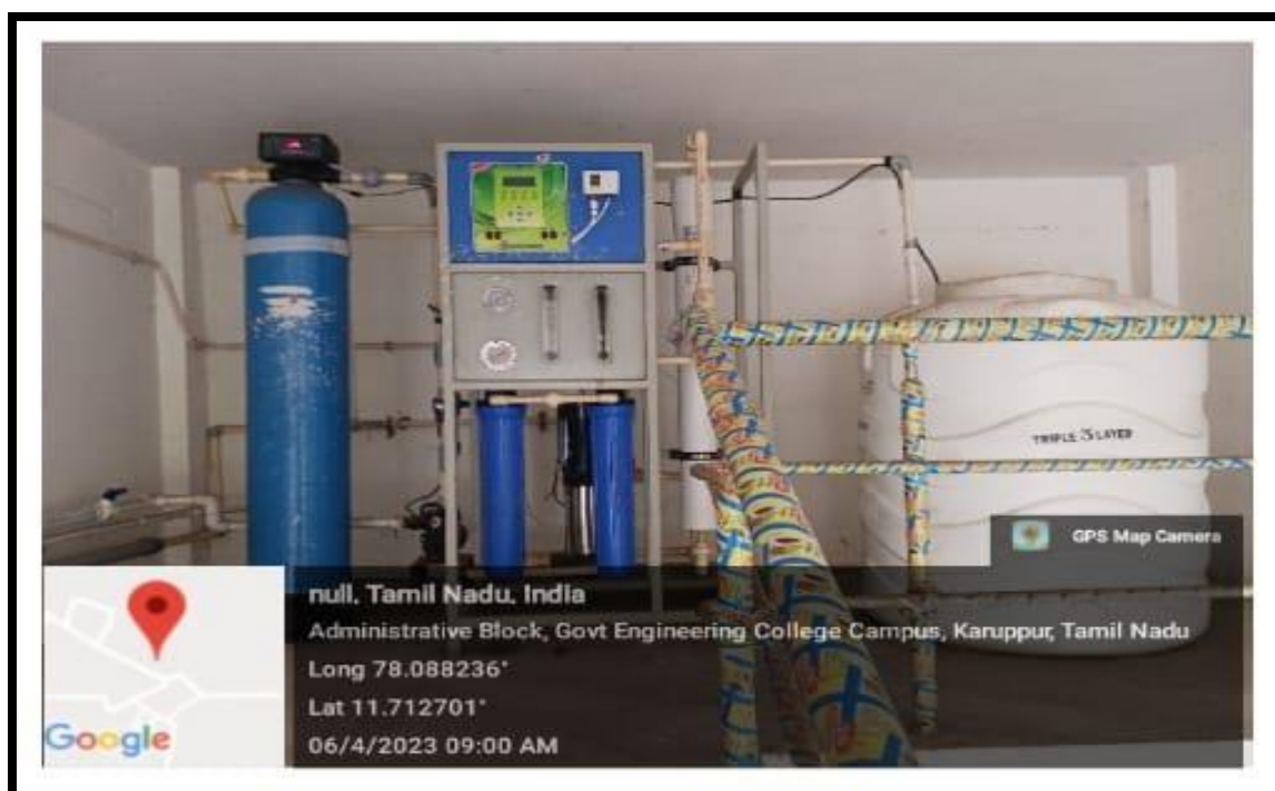
Figure 12: Dedicated Water Purifying System

The institute has sufficient water purifying systems, water doctor units with reverse osmosis system in all engineering department buildings, administrative block, and hostels.