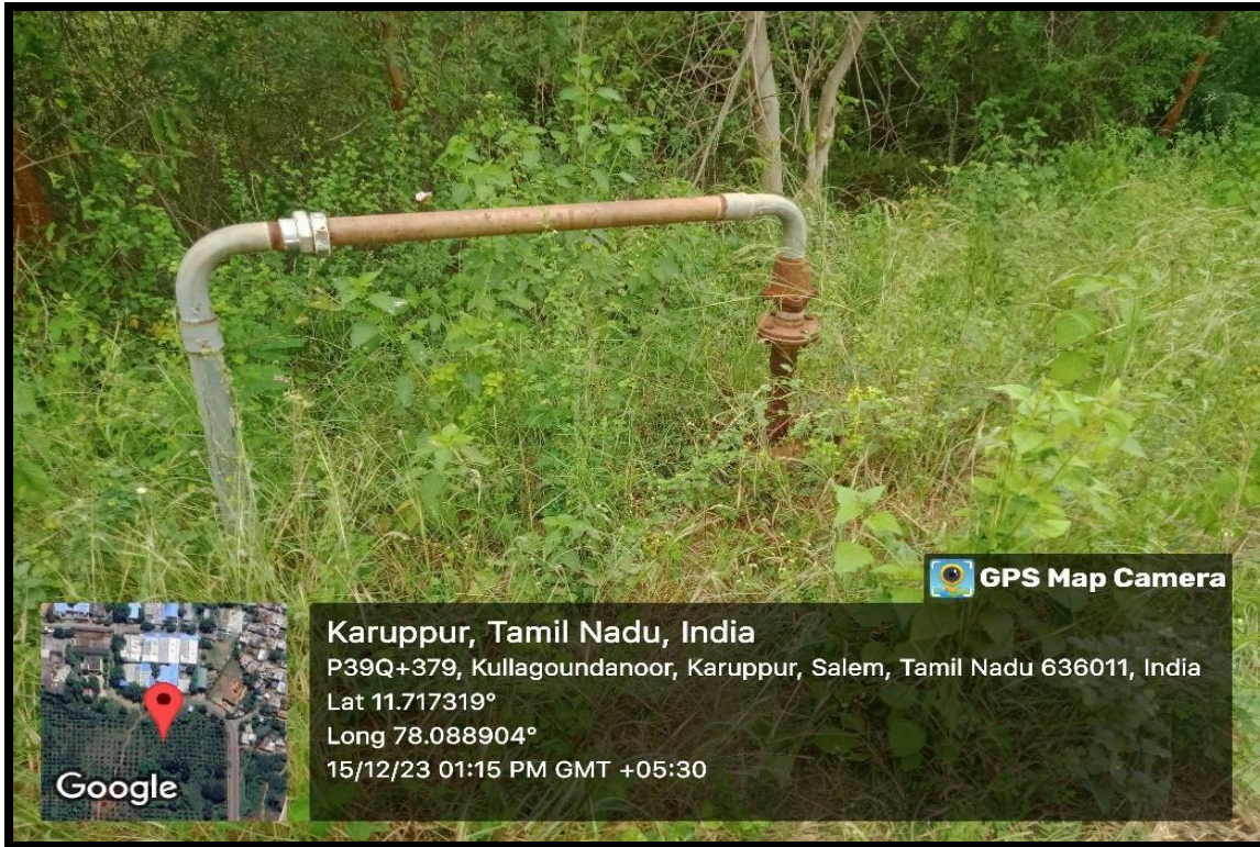
Figure 7: Bore well.