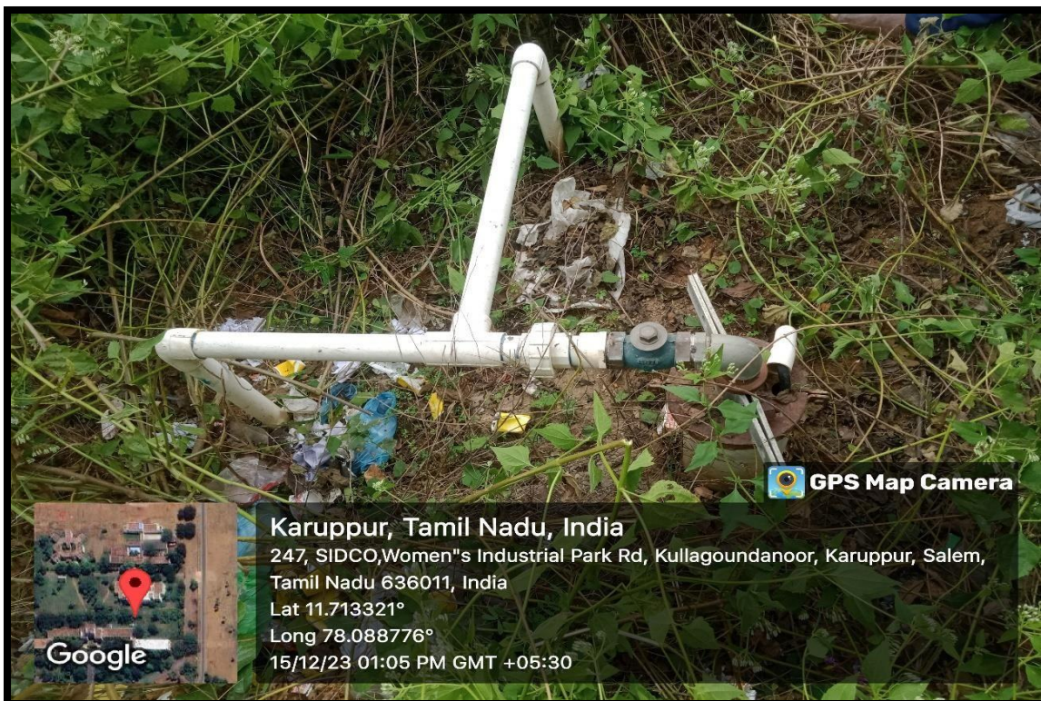
Figure 8: Bore Well