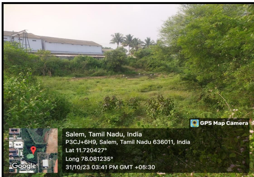
Figure 9: Wastewater collection area

This method is environmentally friendly, using natural processes for wastewater treatment and emphasizing sustainability.