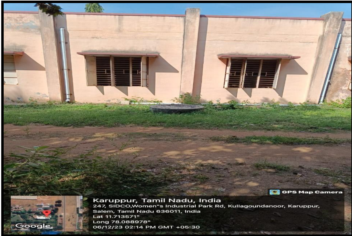
Figure 2: Rainwater harvesting Pit in Department of Mechanical Engineering