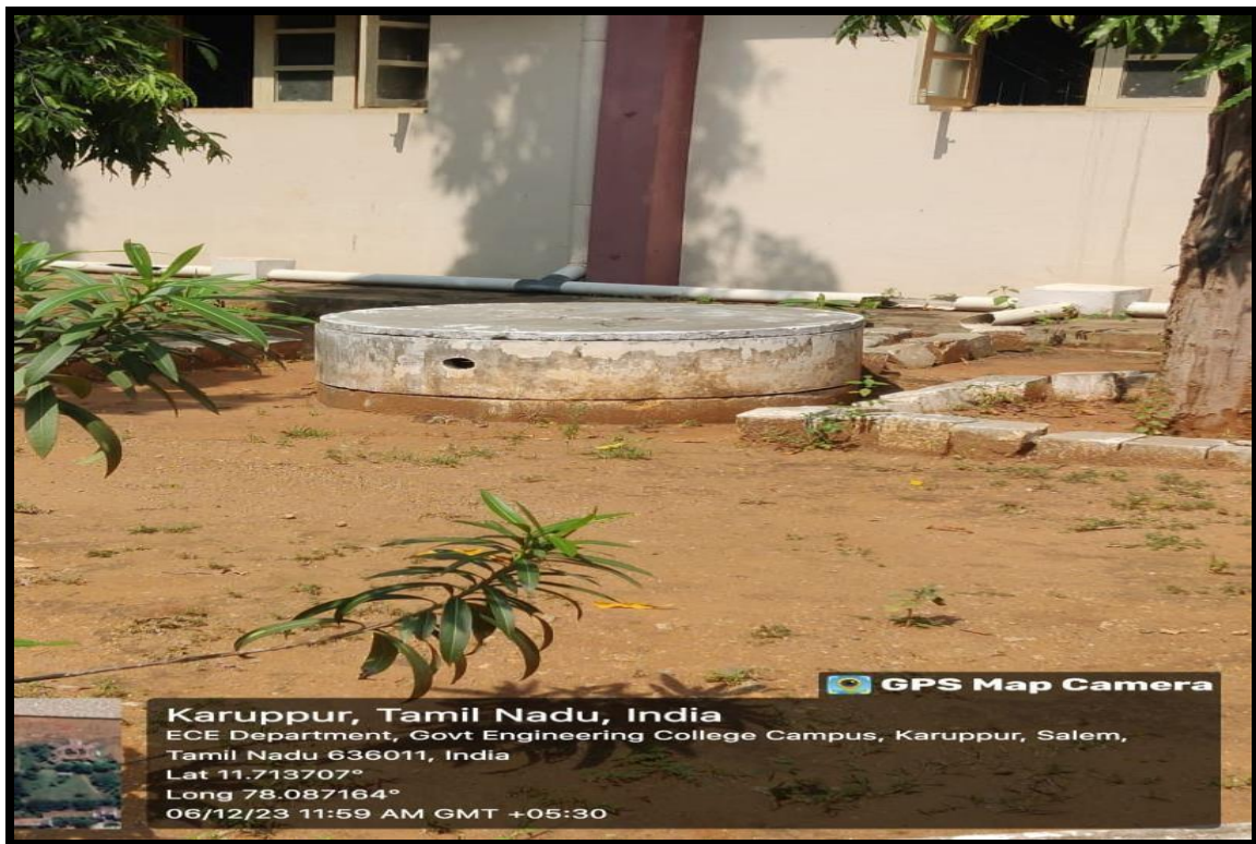
Figure 1: Rainwater harvesting Pit in Department of ECE

The rainwater from roof tops and run off within the campus are collected in harvesting pits to recharge the ground water. Sand filters are used in these rainwater harvesting pits. The rainwater is channelized properly to recharge the ground water level thereby reducing the dependence on water supplied by bore well. These pits are cleaned once in every six months.