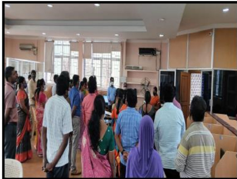
Figure 4.2: Voter's Day Pledge Principal's office