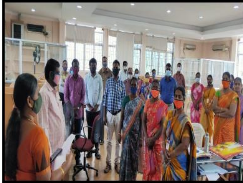
Figure 4.1: Voter's Day Pledge Principal's office