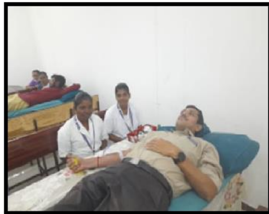
Figure 9.2: Donating blood