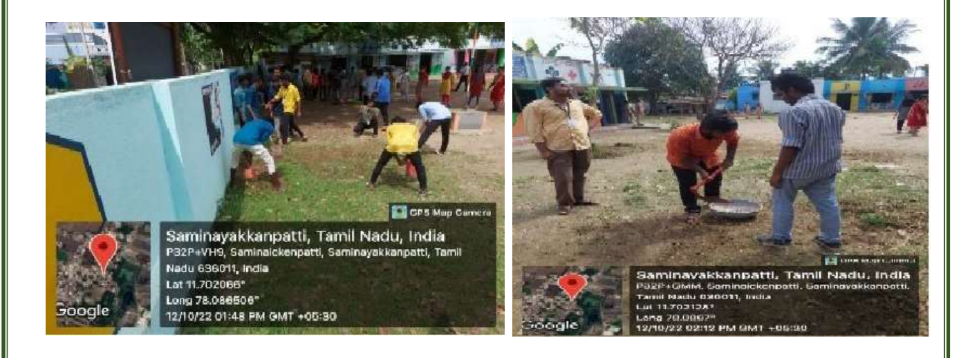
Figure 13.1: Cleaning the school campus.

To keep the environment clean, do not engage in littering on the streets or urinating in public, rather use a public toilet for sanitation. Cleanliness will help you in taking good care of your own health while also keeping the environment clean. When the environment is clean, we lead a healthy and active lifestyle. GCE, Salem students cleaned the schools by removing plastic waste.