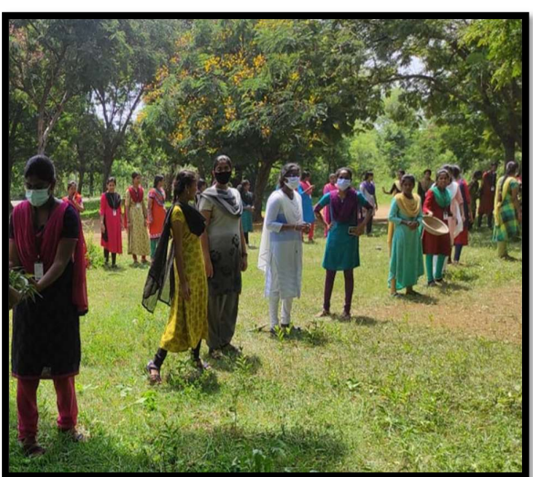
Figure 2.1: Searching plastic bags.

The Leo club organizes a service camp to Yercaud on July 22, 2019, with the aim of contributing to community development and fostering a sense of social responsibility among its members. The event brought together 30 enthusiastic students, eager to make a positive impact through their collective efforts. The service camp comprised a series of activities designed to address various community needs and promote sustainable development.