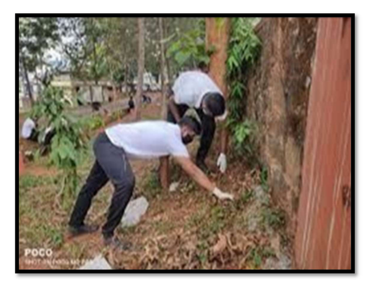
Figure 5.1 - SIDCO Industrial Park, Karuppur Salem

Place : SIDCO Industrial Park, Karuppur Salem