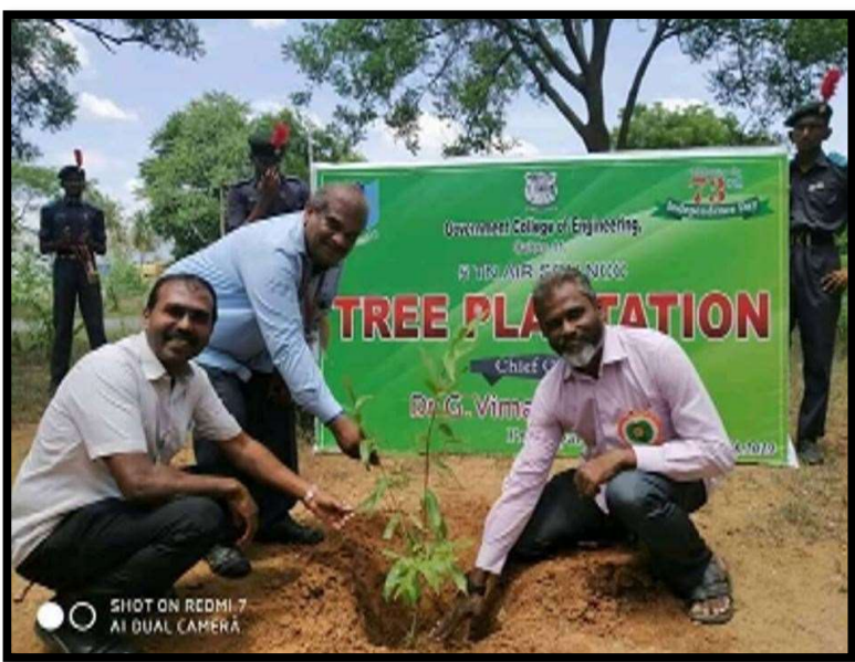
Figure 3.1: Tree Plantation at Saminayakanpatti