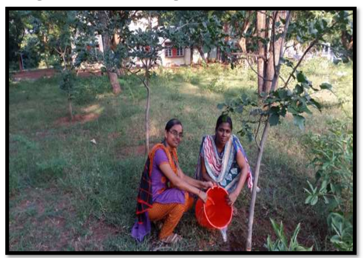
Figure 4.2 - SIDCO Industrial Park, Karuppur Salem