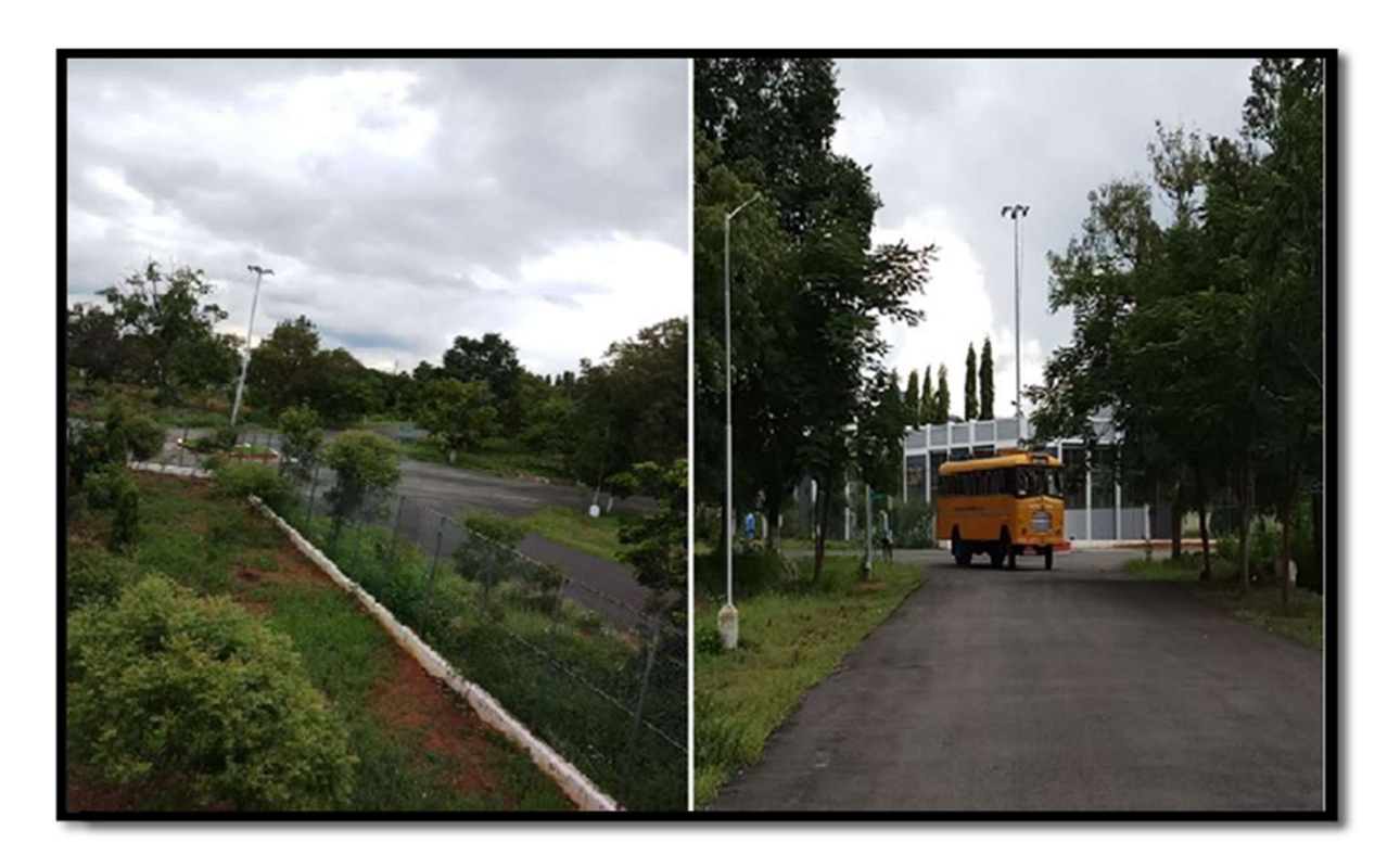
Figure 1.1 - College bus leaving from campus for rally

The Awareness on Impacts of Plastics on Earth program was conducted by GCE, Salem at Karuppur Salem on 20-02-2019 through Environmental Club.