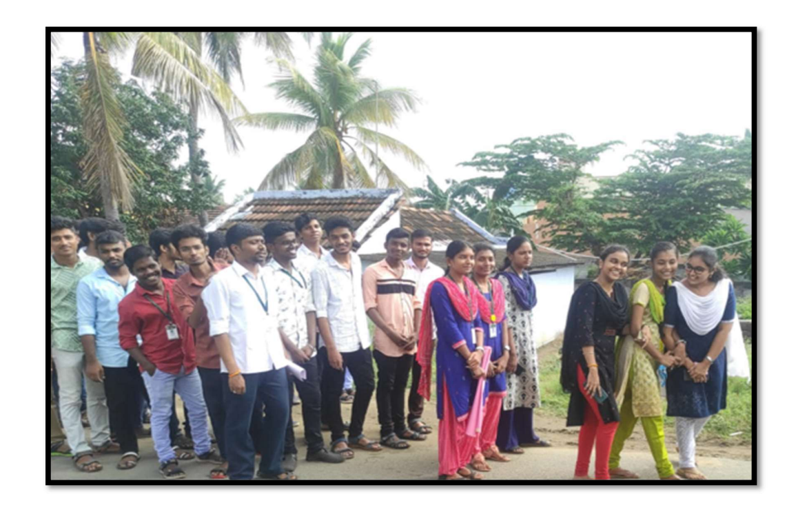
Figure 1.2 -Student Rally for greener tomorrow