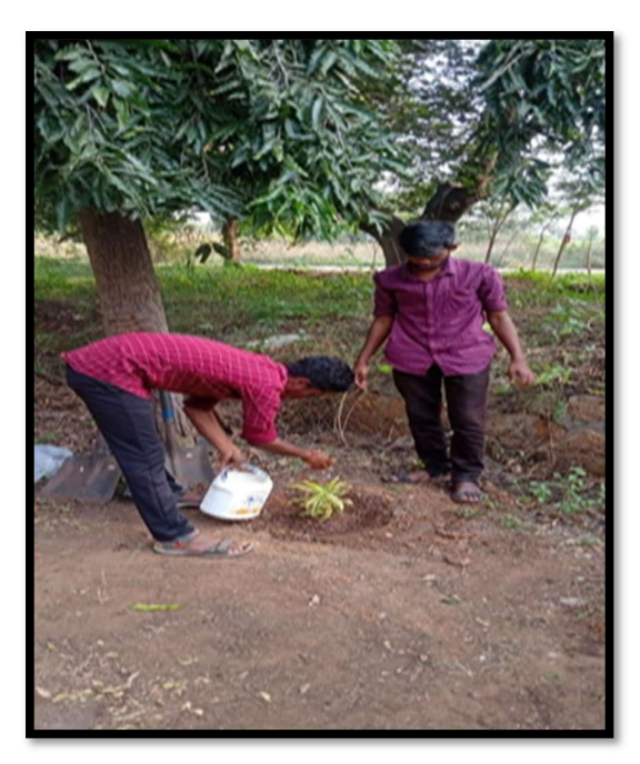
Figure 10.1: Tree Plantation at vellakalpatti village

Place : GCE, Salem and Vellakalpatti village