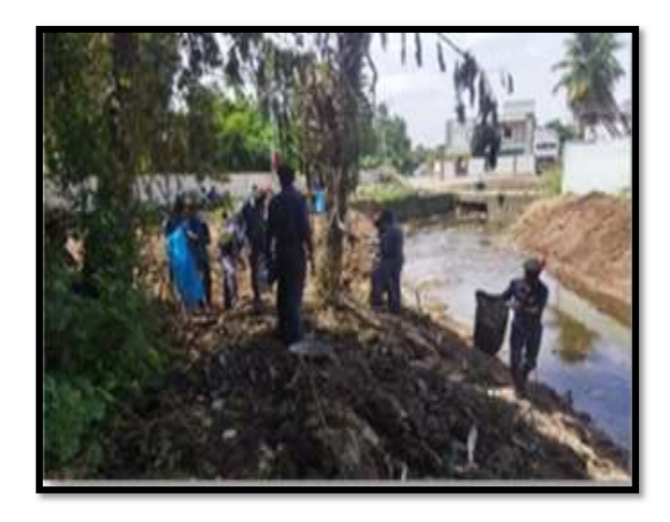
Figure 9.1: Cleaning of plastic waste at SIDCO, Karuppur

Place : GCE, Salem and SIDCO Development Corporation, Salem