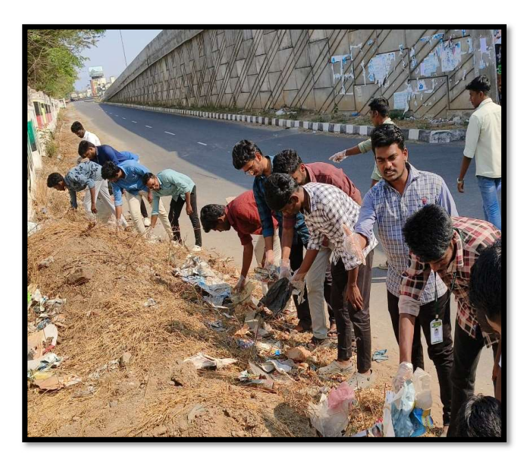
Figure 6.1 - Clearing plastic waste, Anaigoundanpatti.

Place : SIDCO Industrial Park, Karuppur Salem