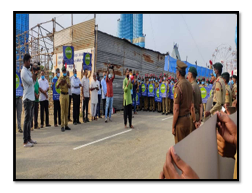
Figure 11.1: Save soil awareness campaign.

In the year 2021, an impactful initiative called "Save Soil" reverberated through Salem's New Bus Stand, driven by a coalition of 20 committed flight cadets, orchestrated by the 5 TN AIR SQD (TECH) NCC, Save Soil.org, and the 12 TN BN NCC - Salem (Army Wing). This collective effort aimed to raise awareness about the critical importance of soil conservation and sustainable practices. The venue, chosen strategically for its accessibility and visibility, served as the canvas for various educational activities and demonstrations. The initiative encompassed informative sessions, interactive workshops, and engaging displays highlighting the significance of soil conservation in maintaining ecological balance. The flight cadets, with their dedication and enthusiasm, played a pivotal role in executing the campaign. They actively engaged with the public, disseminating information about soil degradation, its impact on agriculture and biodiversity, and the urgent need for preservation. Practical demonstrations on composting, soil testing, and techniques for minimizing soil erosion were showcased, educating attendees on actionable steps for soil conservation in their daily lives.