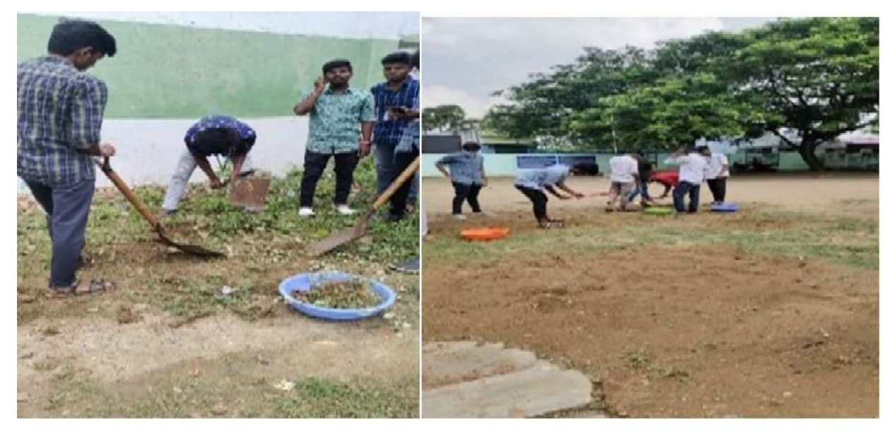
Figure 15.1: Cleaning the school campus.

They provide us with a variety of things to fulfil our daily requirements, including food to eat, air to breathe, clothes to cover our body, wood, medicine, shelter, and many products for human benefit. Plants are the primary producers, and all other living organisms on this planet depend on plants. GCE, Salem students were identified and removed the unwanted plants and created awareness.