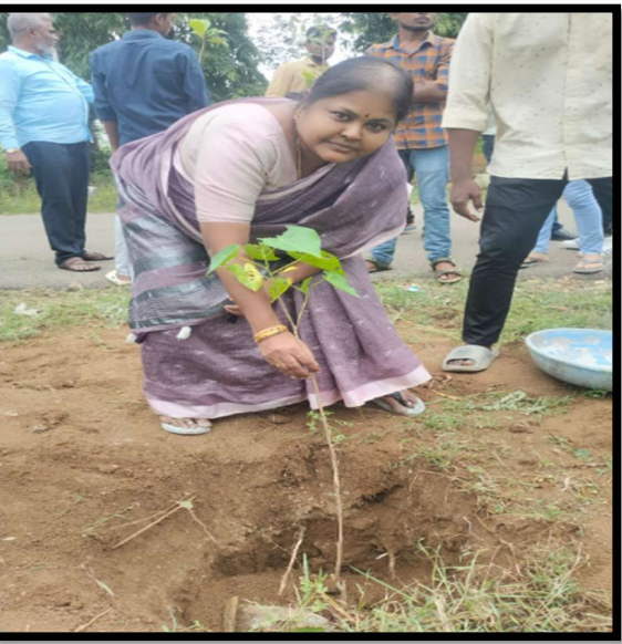
Figure 8.1: Tree Plantation at Sangitapatti

The Go Green Initiative works toward fostering sustainable schools and clean environments that children need today to have a healthy planet for tomorrow. We partner with school officials, staff, and students to improve the quality of air, water, food, and facilities while conserving natural resources.