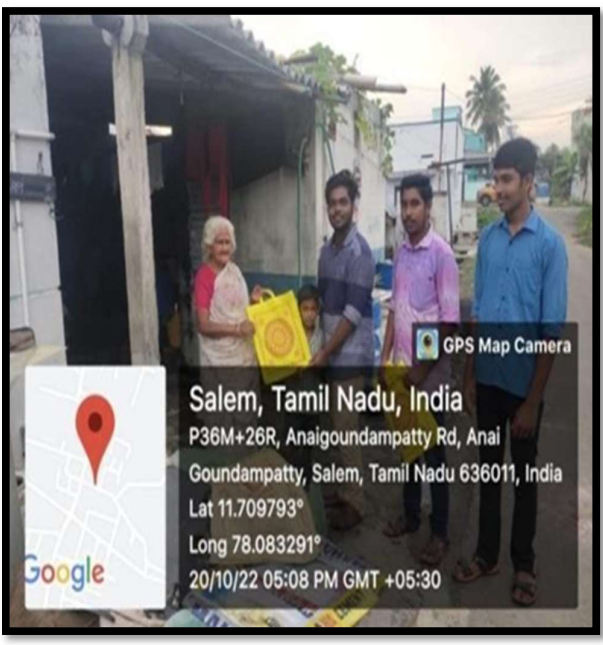
Figure 14.1: Distributing cloth bags.

The primary objective of the campaign was to raise awareness about the importance of waste management and environmental conservation. The initiative focused on distributing yellow sack bags to the residents of Karppur and Anaigoundampatti as a sustainable solution for waste disposal.